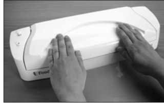
Press and Release Lid